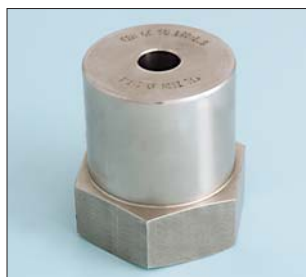
Tipo / Type O4 x