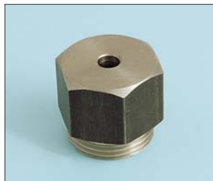
Tipo / Type O4 y