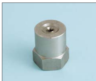
Tipo / Type O3 x