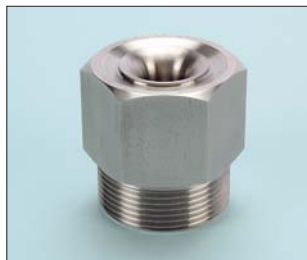
Tipo / Type O3 y