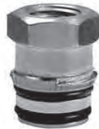
ZTA, ZLTA 1/8" - 1/2" BSPT Female Only Brass, 303 & 316 SS