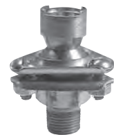
ZAJ, ZLAJ 1/8" - 1/2" BSPT Male Only Brass, 303 & 316 SS